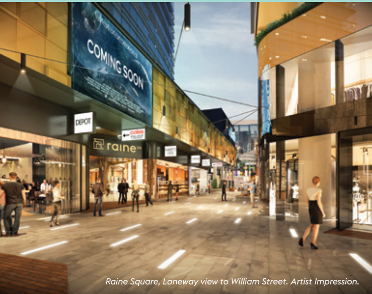
Raine Square, Laneway view to William Street. Artist Impression.